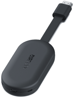
1. Front View